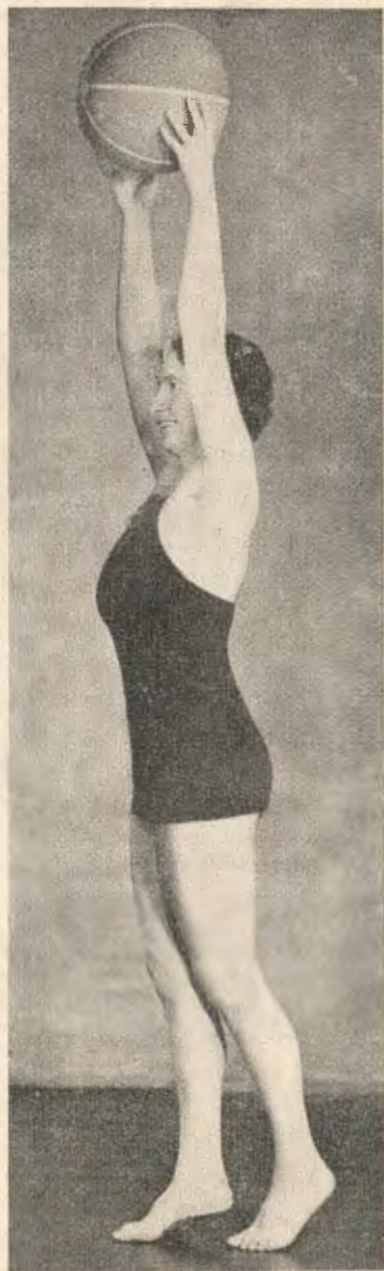
This photograph of the author was taken just prior to her fiftieth birthday.